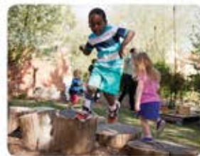
⑦ 'Woods' adventure play