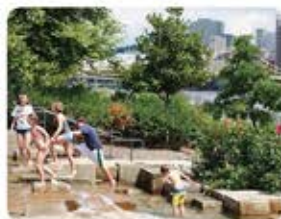
① Flume water feature