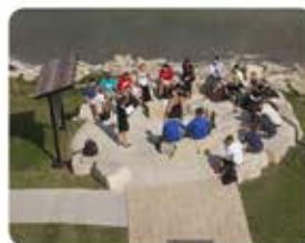
③ River classroom