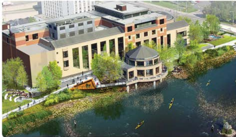
Conceptual rendering of Grand Rapids Public Museum