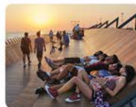
⑥ Treehouse deck