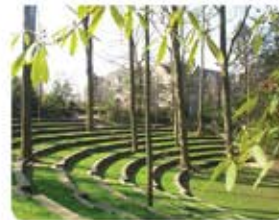
⑨ New shared use amphitheater